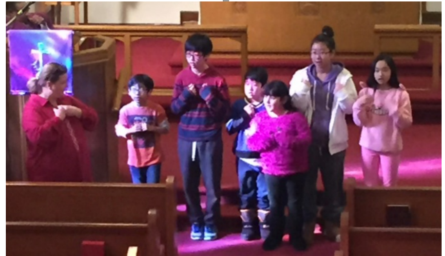
For Valentine's Day the Sunday School children sang for the congregation after the worship service on Sunday, February 14, 2016. The children handed out a special treat for everyone to enjoy. A chocolate dipped pretzel stick with sprinkles.